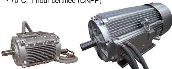
IE2 cast-iron Smoke extraction motor 160 frame size B30 version